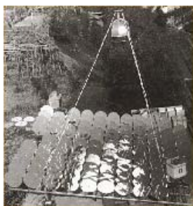
Fig. 3 – Point focus Fresnel reflector first system, Sant'Ilario Station, 1965

For Francia, economic competitiveness was a key factor in a plant's design. The process he followed for the first point focus plant at Sant'Ilario was the reverse of the traditional one. He asked himself what the plant would have to cost to be competitive, and what industry had to offer for the most expensive part, the field of mirrors. He came up with a brilliant solution: a single mechanism that could be mass-produced would turn a whole row of mirrors to focus each one on the boiler (16).